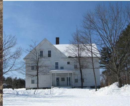
Current Configuration (post 1958)